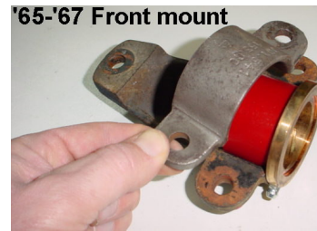
'65-'67 Front mount

Bearings are sandwiched between mount halves when control arms are bolted into car.